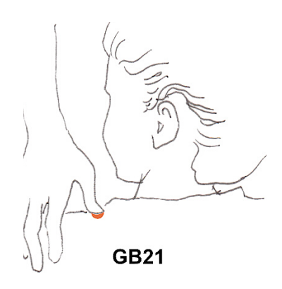
GB21: takes focus from head to body, soothes headache. Don't use in pregnancy.

The images show points you can gently press to bring relief from specific symptoms, or support body and mind as required.